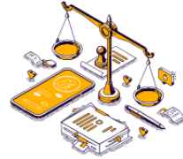
Legal Defense (Up to $25K Lifetime)