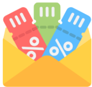
Discounts on CLAS Conferences