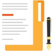
Access to Sample Contracts