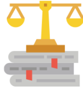
Access to Legal Counsel