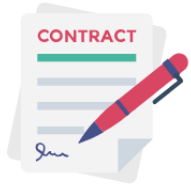
Contract Review Service