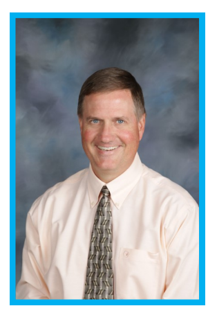
Waller Martin Enterprise Early Education Center Enterprise City

Enterprise Early Education Center has been open for over 13 years. And for the first time we